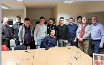
Ystafelloedd cyfarfod Meeting rooms

The Wrexham Welsh Centre, Saith Seren opened in 2012 as a centre for anyone who takes pride, or has an interest in Welshness, to socialise and celebrate our culture. A historical listed building in the town was renovated, without any public funding, in order to create offices and meeting rooms that are used by Welsh organisations, and for Welsh lessons. Contact the Manager in order to rent an office, hire a room, or to organise an event on 07885567512.