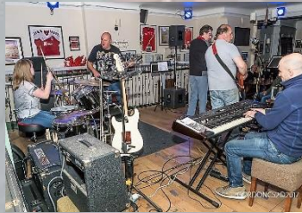
Noson Jamio pob nos Fercher Jam Night every Wednesday night

Mae bandiau lleol pob nos Sadwrn a Carioci ar ddydd lau olaf pob mis Local bands every Saturday night Karaoke every last Thursday of the month