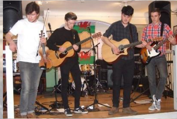
Gigiau Cymraeg rheolaidd Regular Welsh language gigs

Corau a phartïon e.e. Côr Offiws Y Rhos Choirs and parties e.g. Rhos Orpheus Choir