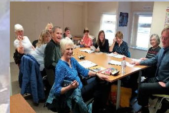
Dosbarthiadau Cymraeg Welsh classes

Sioeau comedi a drama Comedy shows and dramas